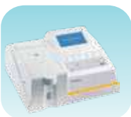
Semi Auto Bio Chemistry Analyzer