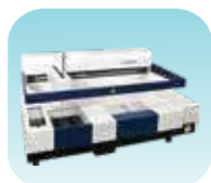
Fully Automated CLIA