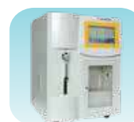
Liquid Partical Counter