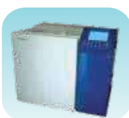
Optima Gas Chromatograph 2979 Plus