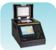
PCR/Gradient PCR/ RTPCR