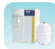
Water purification system