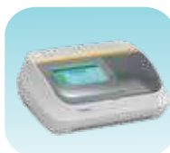
Micro Plate Reader/Washer