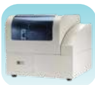
NOVA-2100 Chemistry Analyzer