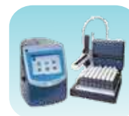
Total Organic Carbon 3800