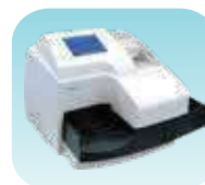
URINOVA 2800 Urine Analyzer