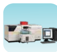
Atomic Absorption Spectrophotometer