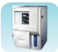
HEMA 2062 Hematology Analyzer