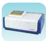
UV/VIS Spectro 2080+ Double Beam