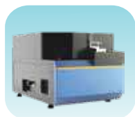
Optical Emission Spectrophotometer