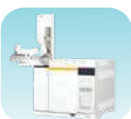
Optima Gas Chromatograph 3007